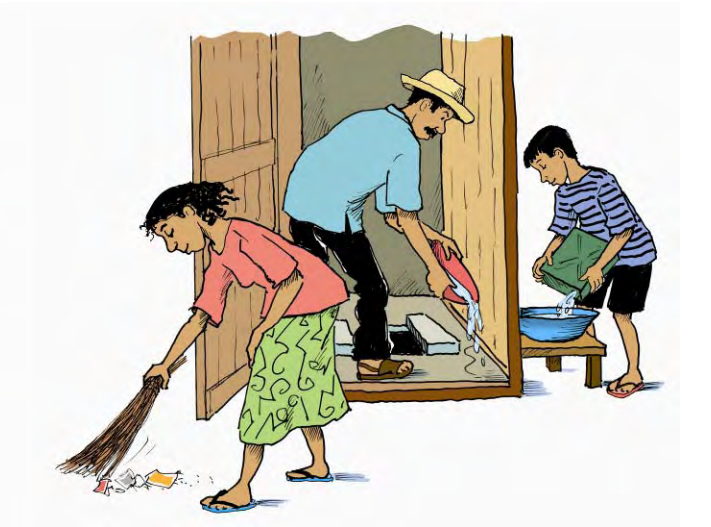
Positive or Neutral (no soap)