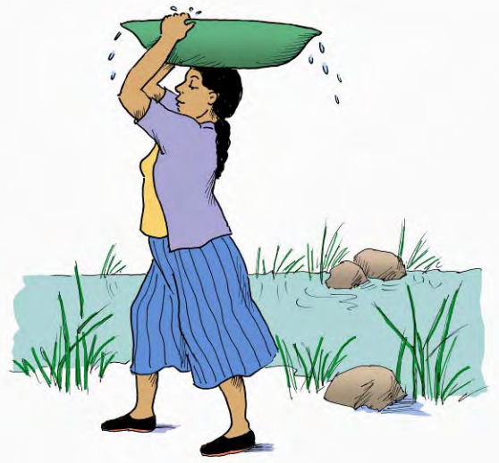
Negative (should cover water)