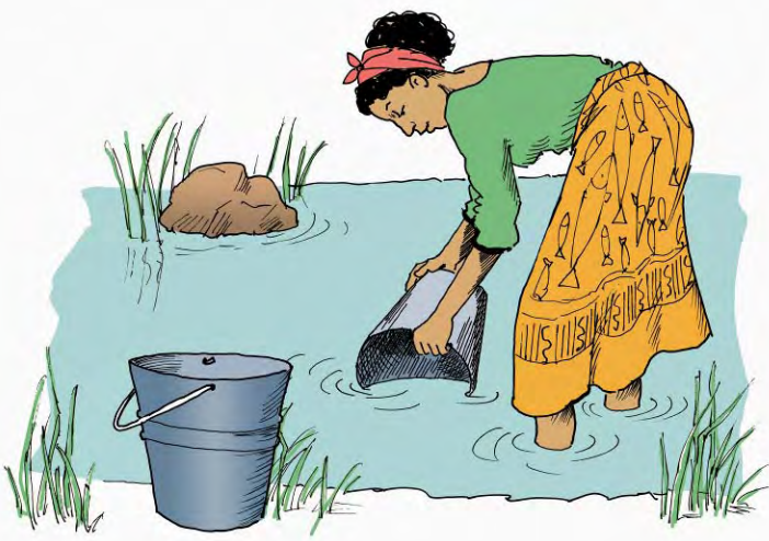
Neutral (Don't know if will treat water)