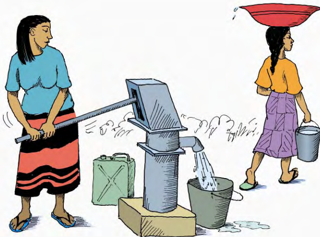
Neutral (positive pumping water, negative not covering water)