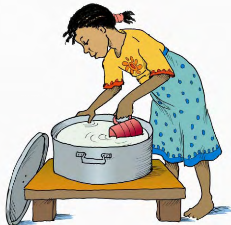
Negative (hand in water or cup may dirty)