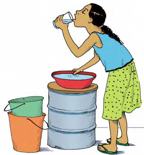
Negative (hand in water)